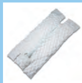
WARMTOUCH™ FULL BODY MULTI ACCESS BLANKET

A full range of blankets to accommodate a range of patients and procedures.