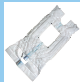
WARMTOUCH™ SURGICAL ACCESS BLANKET STERILE

Inflated 34 in W x 53 in L 86 cm W x 135 cm L