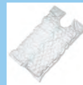
WARMTOUCH™ PEDIATRIC FULL BODY BLANKET

Inflated 22 in W x 35 in L 56 cm W x 89 cm L