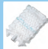
WARMTOUCH™ PEDIATRIC SURGICAL BLANKET

Inflated 35 in W x 74 in L 89 cm W x 188 cm L