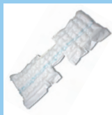
WARMTOUCH™ UPPER BODY BLANKET

Inflated 33 in W x 74 in L 84 cm W x 188 cm L