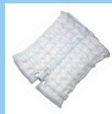
WARMTOUCH™ LOWER BODY BLANKET

Inflated 44.5 in W x 36 in L 113 cm W x 91 cm L