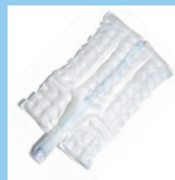
WARMTOUCH™ CARDIAC BLANKET STERILE

Inflated 34 in W x 52 in L 86 cm W x 132 cm L