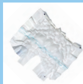
WARMTOUCH™ TORSO BLANKET

Inflated 72 in W x 24 in L 183 cm W x 61 cm L