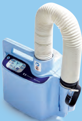
WarmTouch™ Convective Warming Unit