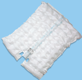
WarmTouch™ Lower Body Blanket